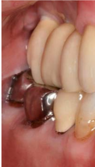
Figure 5b Buccal view of the situation after the chipping of the ceramic veneering at the tip of the mesiobuccal cusp of 16.