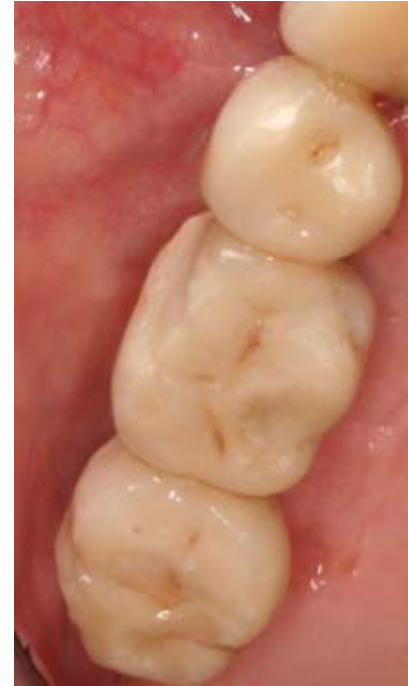
Figure 5c Occlusal view of the situation after the chipping of the ceramic veneering at the tip of the mesiobuccal cusp of 16.