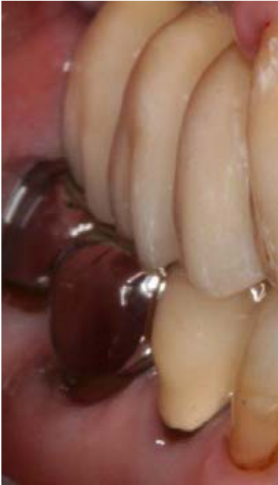
Figure 5a Clinical example showing the relationship between occlusion and ceramic chipping. Initial situation: cusp-to-cusp occlusion at implant crown 16 and tooth crown 46.