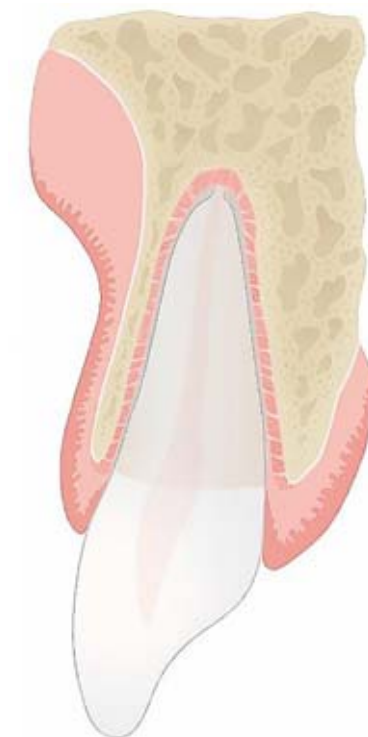
Figure 1 Schematic representation of a cross-section through a natural tooth together with periodontal tissue.

The recorded EMG reflex responses are reduced by approx. 90%