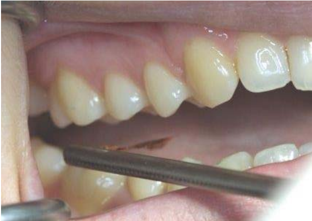
Figure 3a Experimental procedure for interocclusal tactile sensibility/active tactile sensibility: cheek retractors are used to retract the corners of the mouth and a test foil is inserted in the interocclusal space.