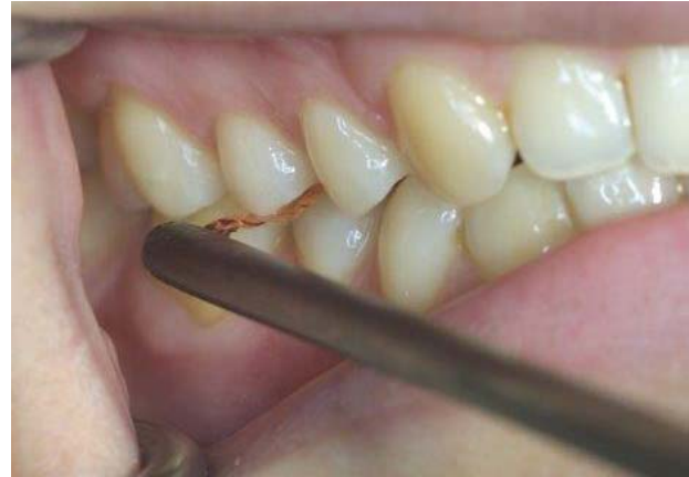
Figure 3b Test position: after the investigator's request, teeth clenching is performed by the subject.