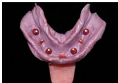
Figure 5 Lower jaw, impression