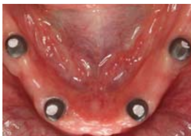
Figure 6 Lower jaw, abutments