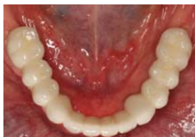
Figure 7 Lower jaw, fixed bridge