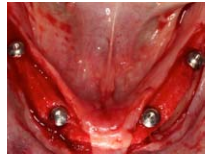
Figure 3 Implant surgery lower jaw

Therapy: After obtaining panoramic radiography, the patient was informed about poor prognosis of the remaining teeth 16, 26, 27, 33, 32, 43. The teeth were subsequently extracted and the partial dentures were altered to full upper and lower dentures. After pre-treatment, the radiographic report was discussed with the patient to agree on a suitable treatment plan. The patient rejected conventional dentures. Due to advanced loss in bone height in the premolar and molar region, implant therapy in this area would have required an autologous bone grafting procedure prior to augmentation. To avoid bone augmentation, removable dental prostheses retained by 2 interforaminal implants with Locator® attachments (Zest Dental Solutions, Escondido, California, USA) or placement of 4 interforaminal implants and a bar-retained overdenture were discussed. As a treatment alternative, the patient was informed about participation in an ongoing prospective clinical study. Within this trial, patients were to receive a fixed dental