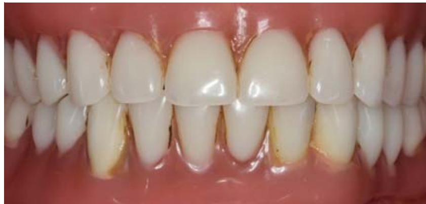
Figure 2 Pre-treatment clinical situation

Knowledge about biomechanics of dental implants has progressed and implant materials, surfaces and design have evolved accordingly over time. This leads to overcoming the dogma of achieving higher stability with long and wide implants [15]. Also, results of current studies appear to show promising evidence for the use of 4 mm short implants. Varying treatment protocols for the use of extra short implants in the mandible have been described.