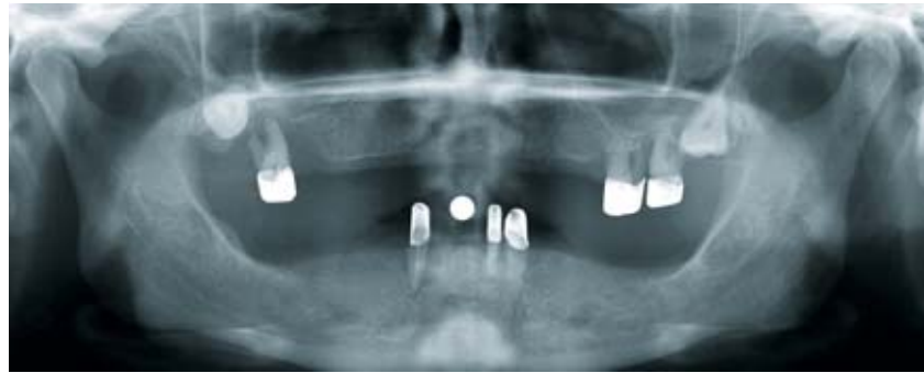
Figure 1 Pre-treatment standard radiograph

Another solution to avoid complex bone augmentation is the insertion of implants with reduced length to allow more patients to benefit from implant treatment with higher patient comfort. Implants with a length of 4 mm are the shortest currently available.