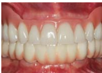
Figure 8 Intraoral overview

sis can prevent overloading of the implants. Crown margins were positioned supra- or epigingival to allow for full removal of cement residue.